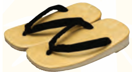
LS40/L 9.75" L (5/60)