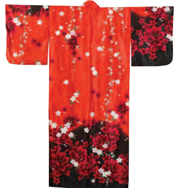
STS-K19/RE 56" Kimono (1)